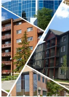
Tenants Rent from us