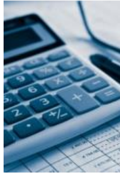
Investors Invest with us