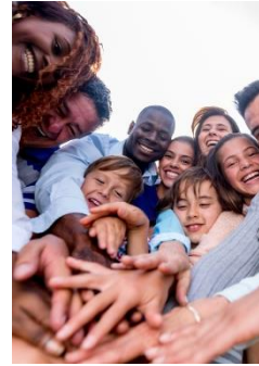
Communities Grow stronger with us