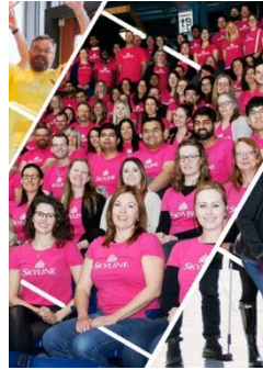
Employees Work with us